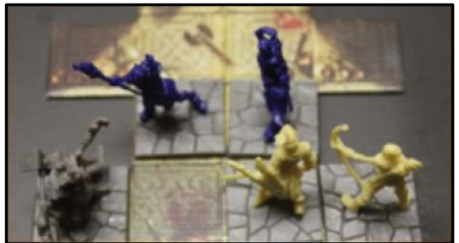
Diagram B: Madriga has both the Armoured Zombie and the Skeleton Archer in her Front Arc and so may attack either, regardless of the fact that she could not move into the Skeleton Archer’s square even if the Skeleton Archer was not there.

A: Yes. See diagram B below for an example.