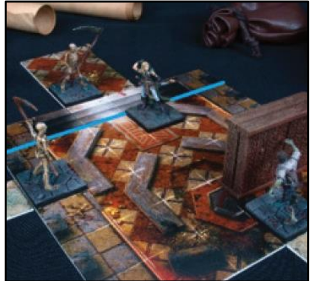
Diagram A: Madriga only has line of sight to the Skeleton Warrior to her right. Line of Sight to the Zombie is blocked by the bookcase, and she cannot see the Skeleton Warrior behind her. If the bookcase was replaced with a low table that granted cover, line of sight would not be considered to be blocked, but a cover modifier would apply to the dice roll when shooting the Zombie.

Replace “-1 for the defender if the shooter is completely within its rear arc” to “-1 for the defender if the shooter is completely behind the defender”.