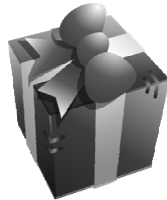
Table IV: Future Gifts